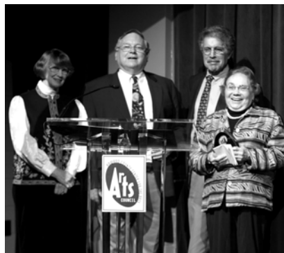
Columbia Film Society 2009 Outstanding Business Supporter of the Arts