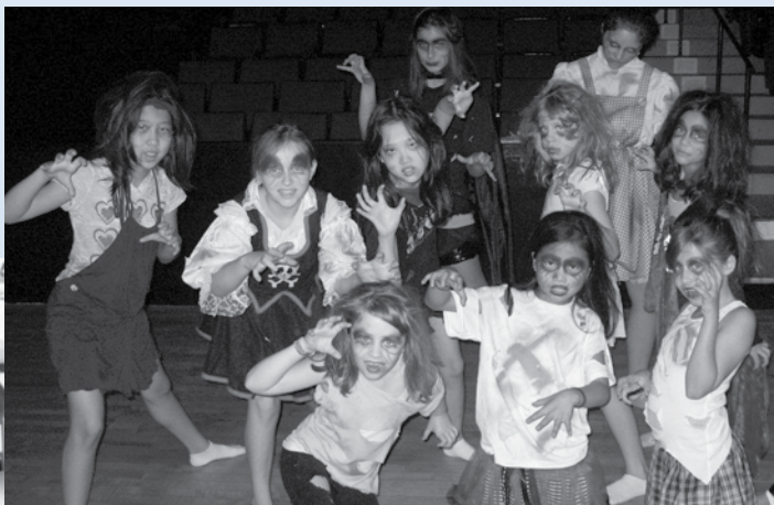
Participants in Summer Camp 2010 at the Howard County Center for the Arts