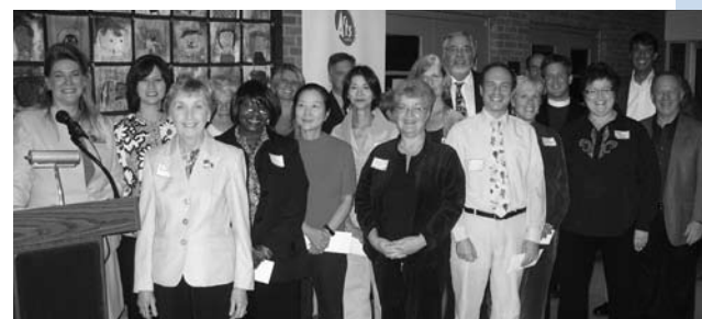
Recipients of the FY10 Community Arts Development Grant Program

The Arts Council's grant program is supported through grants from the Howard County government and the Maryland State Arts Council as well as through our own foundation, and individual giving initiatives.