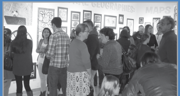
Gallery I: Gamechangers: Collaboration, Play, and the Search for New Ideas | Gallery II: No Boundaries