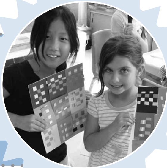
2013 summer campers proudly display their artwork

Howard County Arts Council presents Paint It! Ellicott City , a juried plein air paint-out and exhibit. Come see artists in action as they paint Historic Ellicott City, or set up your own easel and join the fun! Juror Presentation: 7/10. Paint-Out: 7/11–7/13. Reception: 7/14, 6–8pm. Free. HCCA, Ellicott City. 410-313-ARTS (2787). www.hocoarts.org