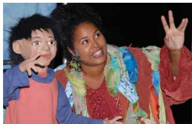
Smithsonian Discovery Theater performs at the 2016 Cultural Arts Showcase

The Showcase is sponsored jointly by the Arts Council and the Recreation and Leisure Services (RALS) Branch of the Maryland Recreation and Parks Association. Advance registration is required. To register, visit hocoarts.org or call 410-313-ARTS (2787) no later than October 6.