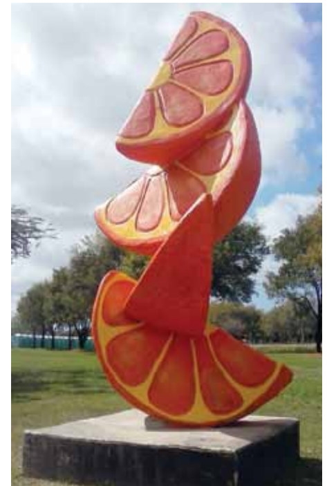
Slices of Heaven , by Craig Gray, installed at North Laurel Community Center

ARTsites sculptures will be in place through July 2018. Visit the Center for the Arts to pick up a free ARTsites brochure or call 410-313-ARTS (2787).