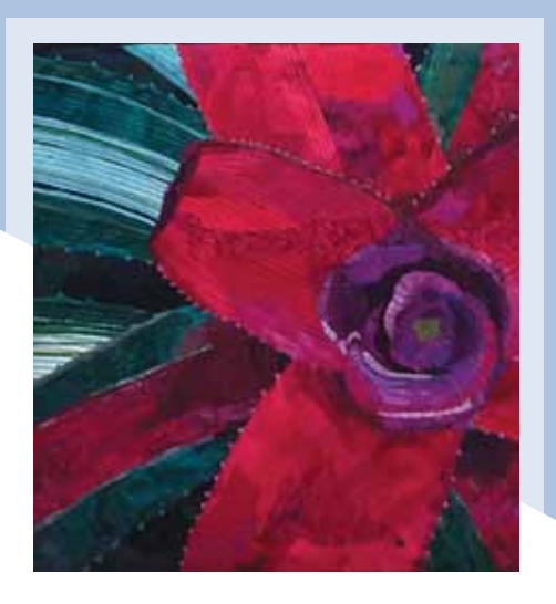
Bromeliad, by Joyce Ritter, from Resident Visual Artists Exhibit 2018

Gallery I: Resident Visual Artists Exhibit 2018