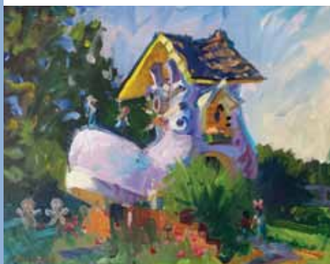
There Was an Old Woman Who Lived in a Shoe by Kyle Buckland