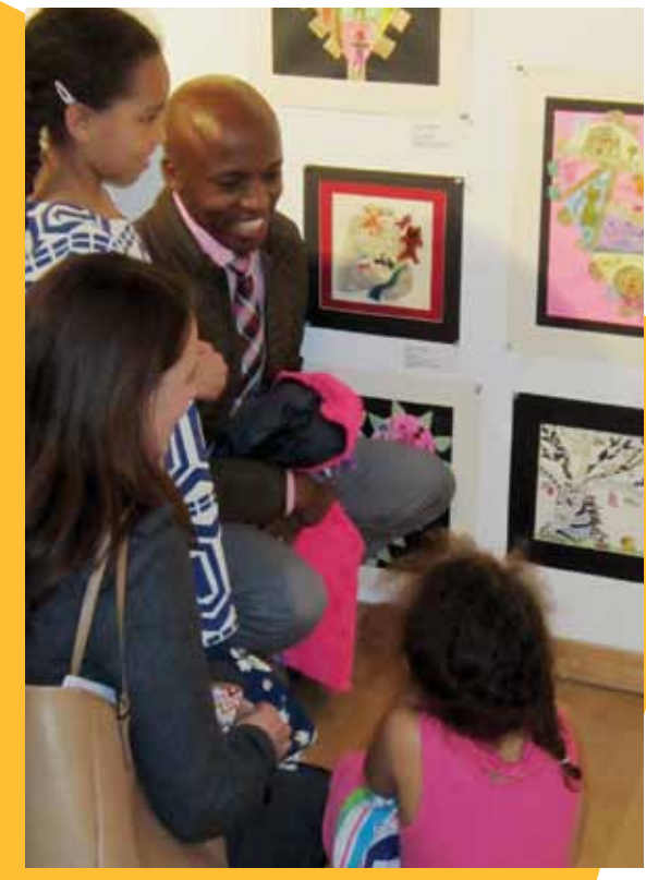
Reception guests enjoy a Youth Art Month exhibit.

Both exhibits are on display from March 8–April 19. To learn more about Arts Council programs and exhibits, call 410-313-ARTS (2787) or visit hocoarts.org .