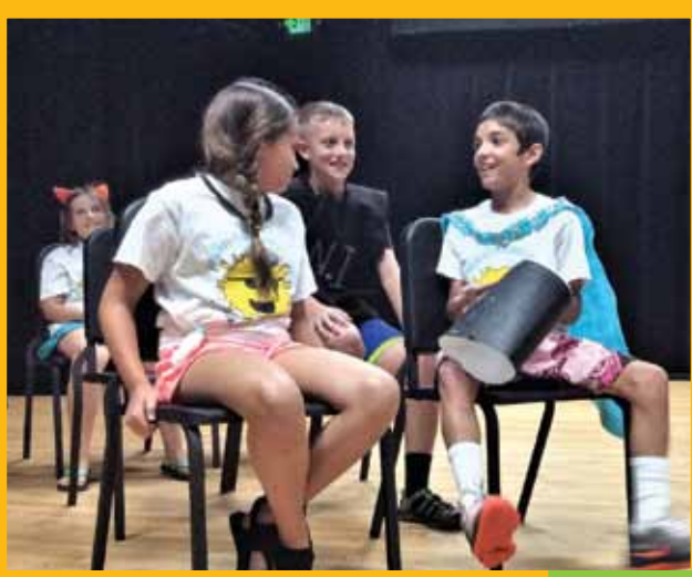
2018 summer campers get creative

Session 1: June 24-28 Session 2: July 1-5* July 8-12 Session 3: July 15-19 Session 4: July 22-26 Session 5: Session 6: July 29–August 2 August 5-9 Session 7: Session 8: August 12-16 August 19-23 Session 9: *4-day session