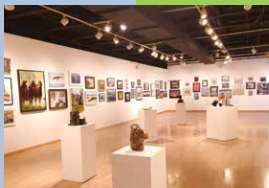
HoCo Open 2020, on display in Gallery I

In Gallery II, What is WATT? showcases Chinese-born multi-disciplinary artist Sizhu Li, who transforms the space into an immersive, kinetic installation composed of aluminum sheets, wood, fans, and light bulbs. Li's unique visual language conveys her understanding of the universe, society, and nature, with influences from both Eastern wisdom and Western philosophy.