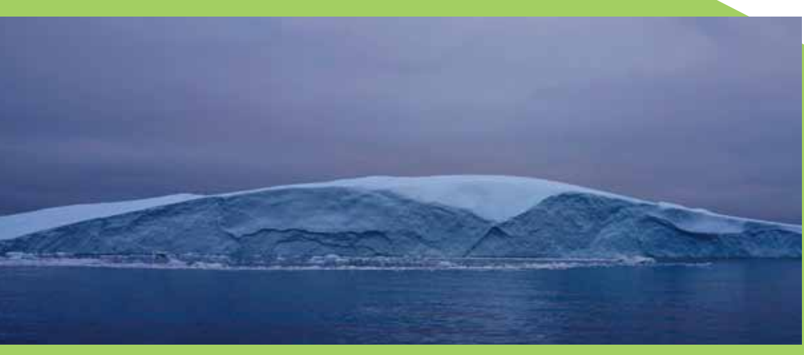
Icescape 37 by Thomas Pickarski, from Natural Formations