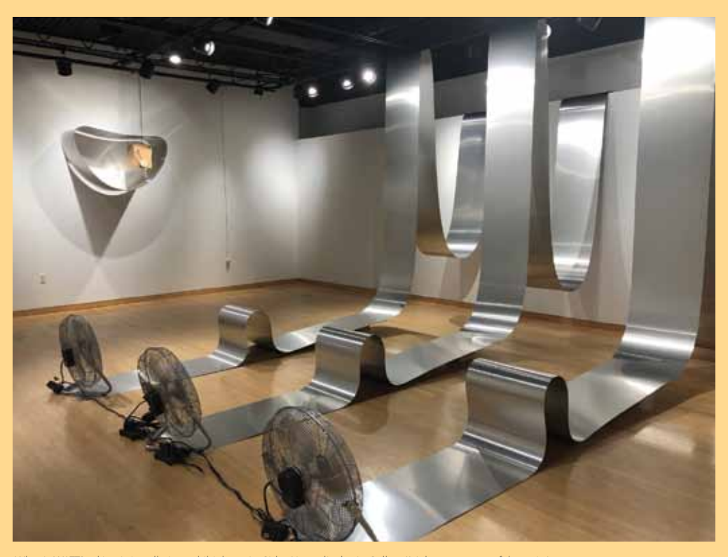
What is WATT?, a kinetic installation exhibit by artist Sizhu Li, on display in Gallery II

For this exhibit, artist Sizhu Li transformed the gallery space into an immersive, kinetic installation composed of aluminum sheets, wood, fans, and light bulbs. A Chinese-born multidisciplinary artist based in New York, Sizhu Li employs a unique visual language of immersive kinetic installations to illustrate her understanding of the universe, society, and nature, with influences from both Eastern wisdom and Western philosophy.