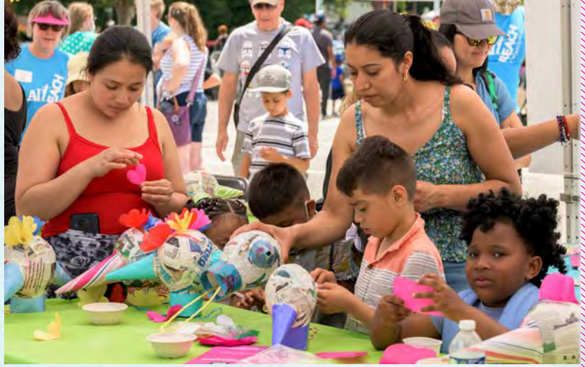
Pinata-making was just one of the free make-and-take art projects the community enjoyed at the ARTreach Festival