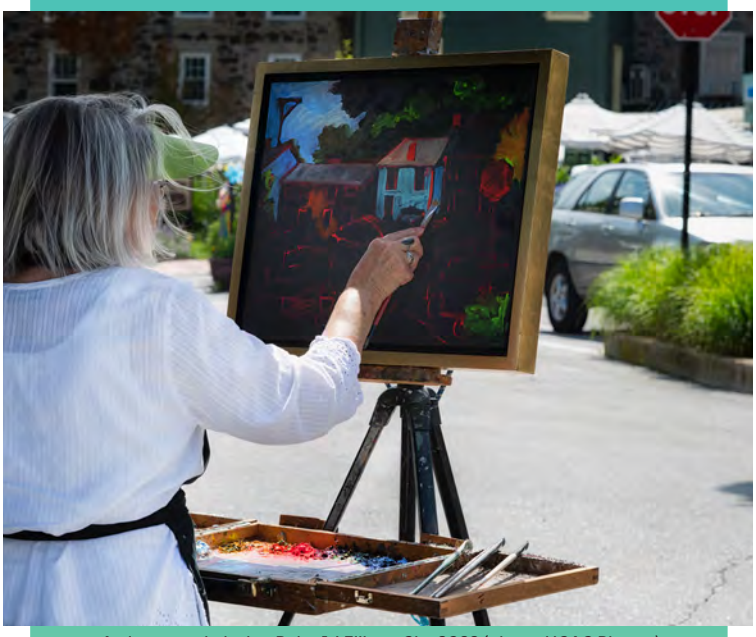
Artist at work during Paint It! Ellicott City 2022

artists and curators — are you looking for a place to exhibit your work? We are seeking artwork in all mediums to include in upcoming exhibits. Individual artists, as well as curators and arts groups interested in presenting a group show, are encouraged to apply. Exhibits are selected and presented in the context of multidisciplinary, thematic, juried, and invitational exhibits. Applications are due April 1. Details and application information are available in the Exhibit Opportunities section at hocoarts.org.