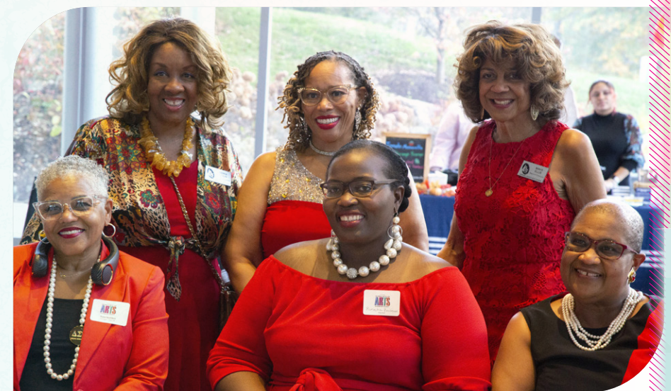
Volunteers from the Columbia Maryland Alumnae Chapter of Delta Sigma Theta Sorority at the 2022 Celebration of the Arts