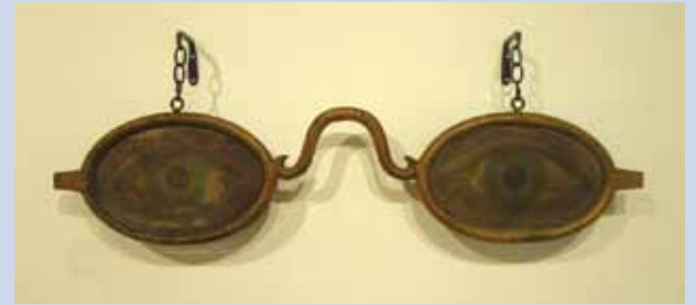
Glasses with Eyes by an unknown artist, from Selections from The Rouse Company | The Howard Hughes Corporation Art Collection , an exhibit commemorating Columbia's 50th birthday