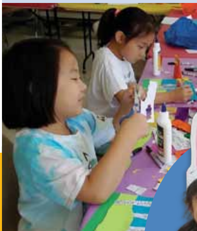
HCAC summer campers