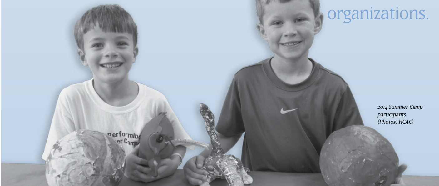
2014 Summer Camp participants