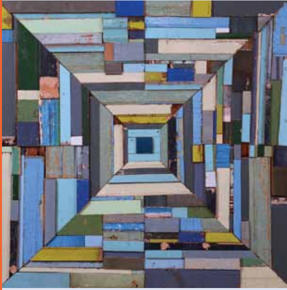
Laura Petrovich-Cheney's Surge , from the exhibit Vertex , an assemblage of wood salvaged from debris left behind after Hurricane Sandy ravaged the New Jersey coast