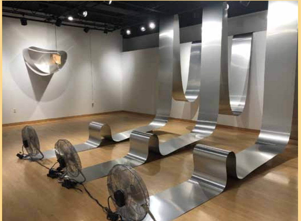
What is WATT? , a kinetic installation exhibit by artist Sizhu Li, on display in Gallery II

For this exhibit, artist Sizhu Li transformed the gallery space into an immersive, kinetic installation composed of aluminum sheets, wood, fans, and light bulbs. A Chinese-born multidisciplinary artist based in New York, Sizhu Li employs a unique visual language of immersive kinetic installations to illustrate her understanding of the universe, society, and nature, with influences from both Eastern wisdom and Western philosophy.