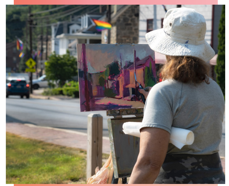
Artist at work during Paint It! Ellicott City 2023