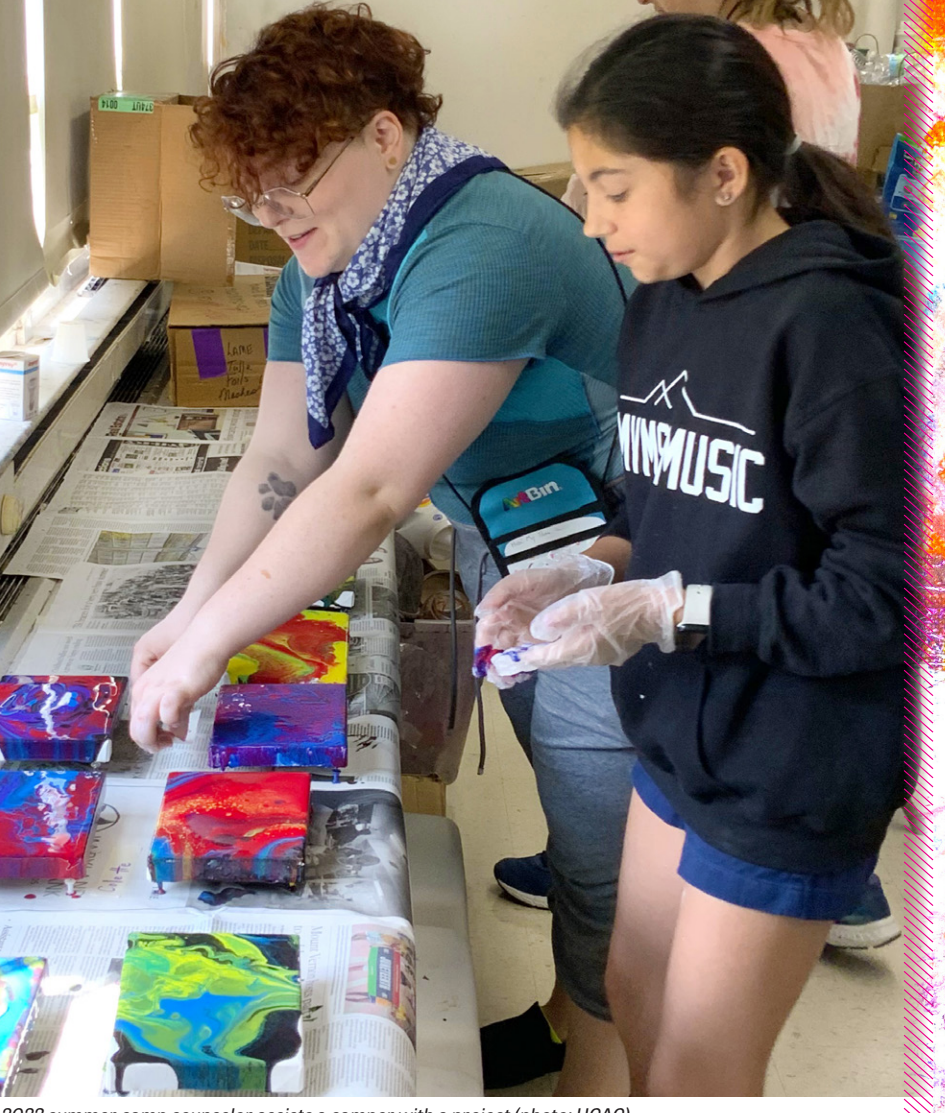
2023 summer camp counselor assists a camper with a project

Water marbling is the ancient art form which uses surface tension to balance paint on the water's surface. Campers will learn to create patterns on the water's surface to create a print on paper and other surfaces.