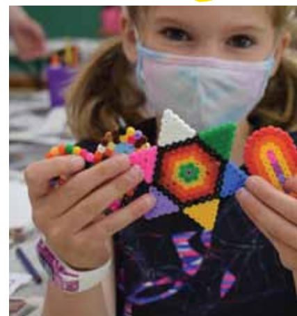
An HCAC summer camper proudly displays finished artwork

Registration for our Visual & Performing Arts Summer Camps will be available January 3, 2022 . Sign up early and choose from a wide variety of engaging and creative opportunities for your child. Camps are open to students entering grades K–7. Full- or half-day sessions and extended care are available. For complete details or to register, visit hocoarts.org .