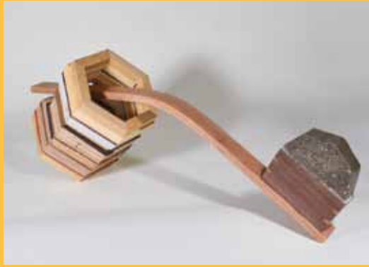
Loo by Andrew Flanders, from Abstraction • Contraption