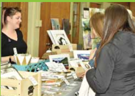
Shoppers at the 2019 Holiday Maker-Mart chat with a vendor

Kick-Off Event: December 2 • 5:30-8:30pm NEW! Juried Holiday Market: December 3-12 Hours: Tuesday-Friday 4-8pm, Saturday-Sunday 12-4pm