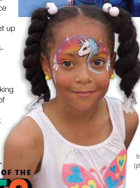
Above: Ocho de Bastos is just one of the great musical acts that will perform at ARTreach 2022 Left: Face painting is just one of the free, family-friendly activities at ARTreach!