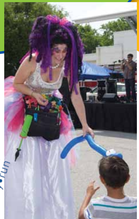
Strolling performers will delight festivalgoers of all ages