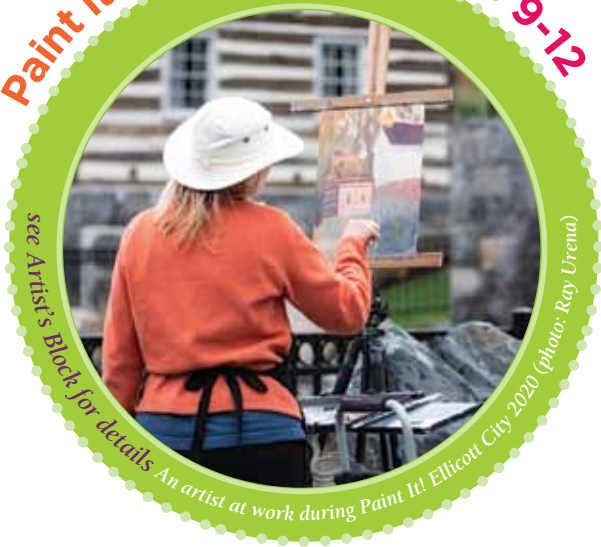
see Artist's Block for details An artist at work during Paint It! Ellicott City 2020

Quarterly Summer 2022 visit hocoarts.org