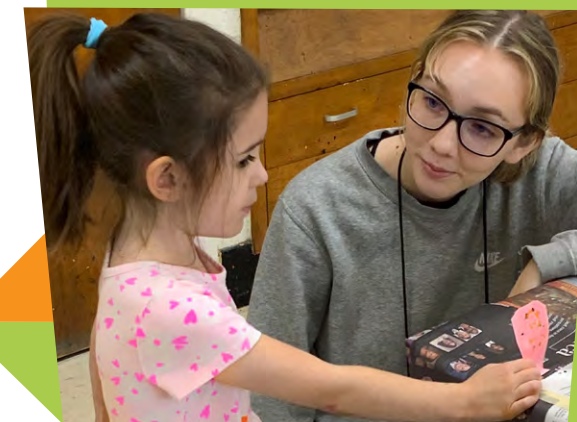
2023 Summer Arts Camp staff member and camper

The Arts Council is accepting applications for paid camp counselor positions and unpaid volunteer positions for our 2024 summer camps. Counselors must be 18 by June 15, 2024; volunteers must be 15 by September 1, 2024. To apply, visit hocoarts.org . Applications open on February 1 with a deadline of March 30, 2024.