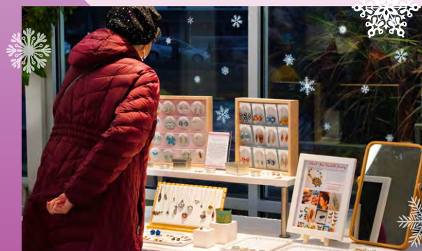
A Maker-Mart shopper explores a vendor's wares

Join us for our annual Holiday Maker-Mart Open House on November 30 from 3-8pm as local artists and artisans offer their unique handmade works for holiday gift-giving. Don't miss this opportunity to 'shop local', 'buy handmade', and support local artists during the holiday season! Enjoy refreshments, music and remember to visit our resident artists' and arts organizations' open studios 7-8pm. And don't miss the Juried Maker-Mart in Gallery I, November 28-December 3 (Maker-Mart Hours: Weekdays 4-8pm, Weekends 12-4pm). Visit hocoarts.org/makermart for details.