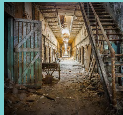
Block 5 by Michael Hower

Gallery I: HoCo Open 2024 | Gallery II: Urbex