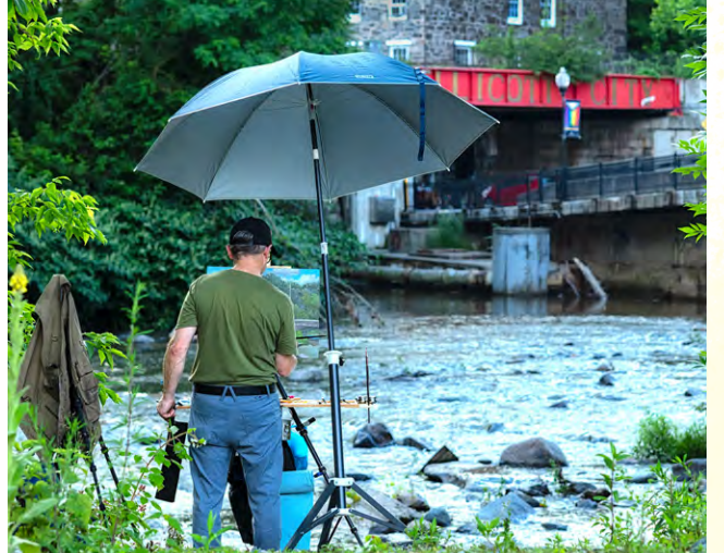
An artist at work next to the Patapsco River during Paint It! Ellicott City 2024

The weather was gorgeous for our annual plein air paint-out June 6-9 as juried artists and more than 50 community painters gathered in historic Ellicott City's historic district to paint the town.