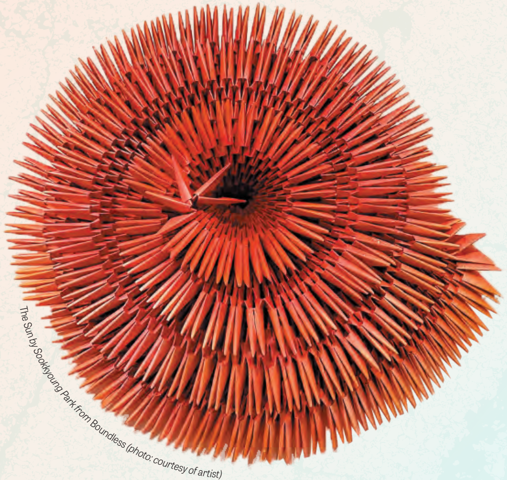
The Sun by Soekhyoung Park from Boundless

Annual salon-style, non-juried exhibit of multi-media artwork by the first 100 artists who applied and lived, worked, or studied in Howard County.