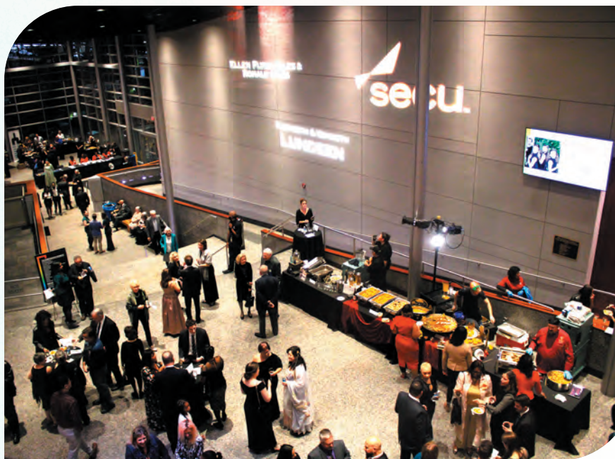
Patrons enjoying themselves at the 2023 Celebration of the Arts