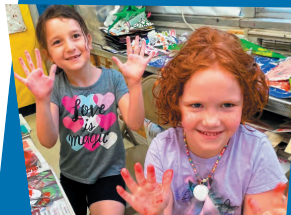
2024 Summer campers getting creative

The Arts Council is accepting applications for paid camp counselors and unpaid camp volunteers for our 2025 summer camps. Counselors must be age 18 by June 15, 2025; volunteers must be age 15 by September 1, 2025. To apply, visit hocoarts.org . Applications open on December 1 with a deadline of February 28.