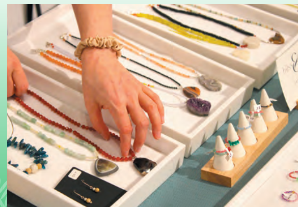
Items for sale at the 2023 Holiday Open House

The juried Maker-Mart will feature local artists offering unique handmade goods for holiday gift giving in our galleries November 23-December 5 from 12-8pm weekdays and 12-4pm weekends. And join us on December 5 from 4-8pm for our Open House where artisans and crafters, including our Resident Artists, will be on hand. Don't miss your chance to shop local, buy handmade, and support local artists during the holiday season. Visit hocoarts.org/makermart for details.