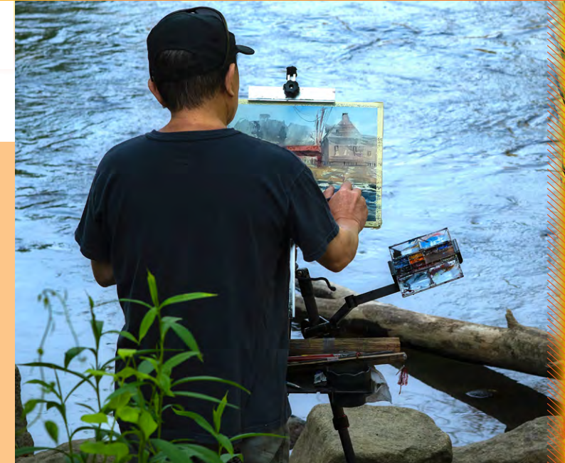
An artist painting next to the Patapsco River during Paint It! Ellicott City 2023.