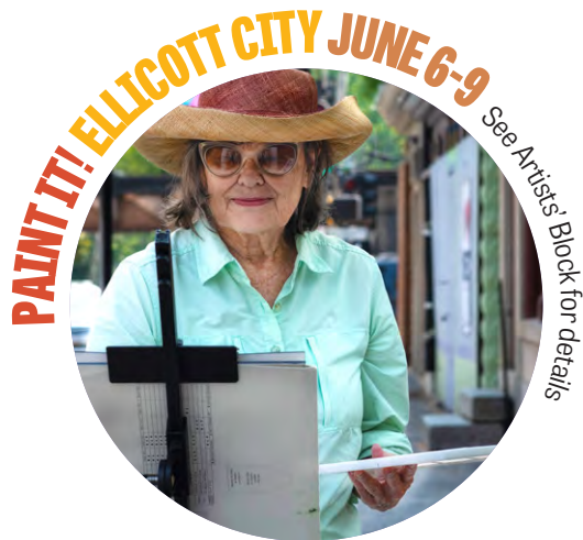
An artist painting on Main Street during Paint It! Ellicott City 2023