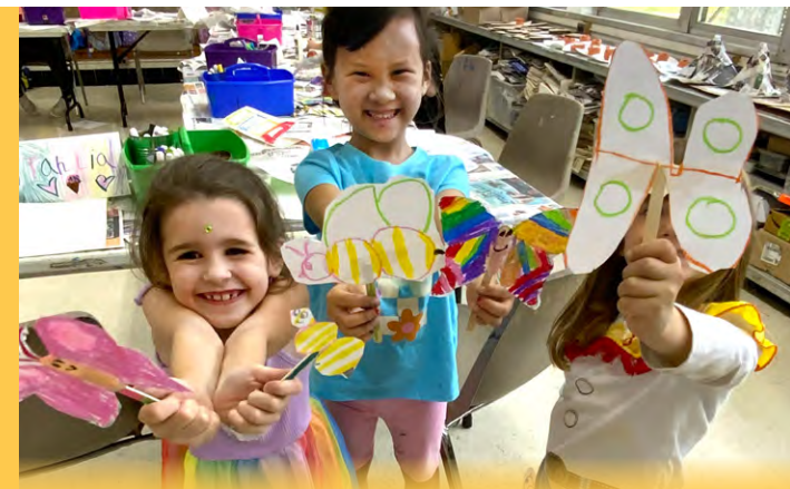
Young artists show off their creations during Summer Camp 2023