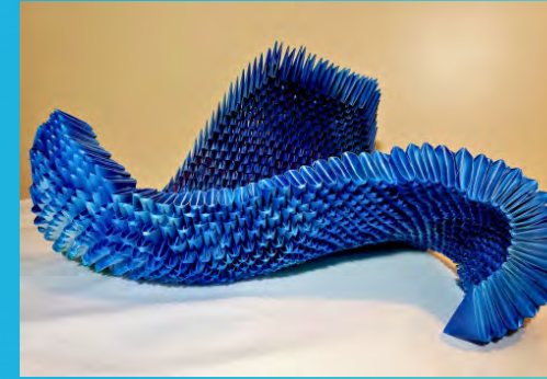
Wave by Sookkyung Park