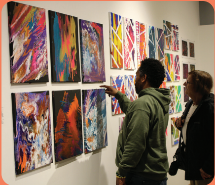
Two patrons at the No Boundaries 2024 exhibit reception

New Howard County Flag designed by Esen Paradiso