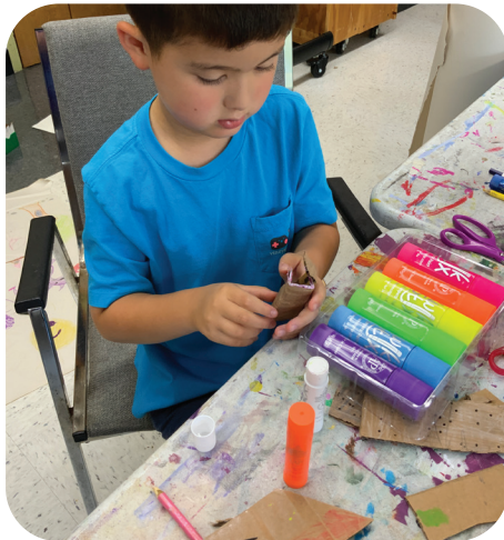
A 2024 Summer Art Camper works on a project

In My Modern Era (Grades 4-7) | Session 3 (July 7-11) AM Design Masters (Grades 4-7) | Session 4 (July 14-18) AM Mixed Media Exploration (Grades 2-5) | Session 4 (July 14-18) PM